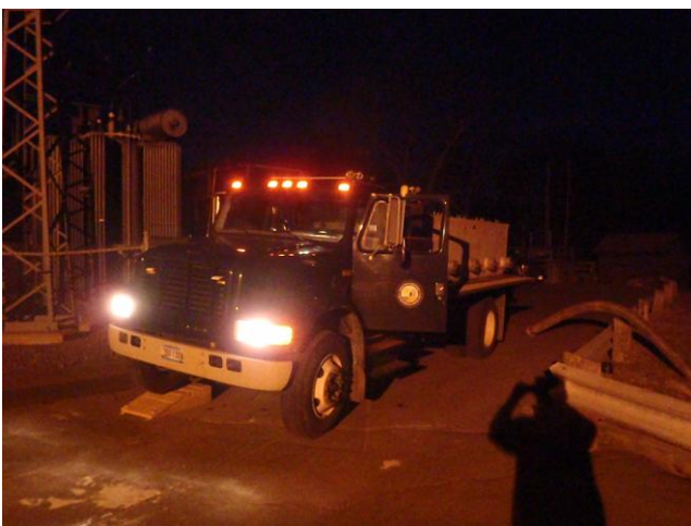
Releasing smolts into the Rainbow Dam tailrace. Note ramps to tilt truck toward the river to help drain the last of the water.

We have stocked hatchery-reared Atlantic salmon smolts into the Farmington River (see photos below). These are night stockings to minimize predation and to better acclimate the fish for night-time migration, which is the norm for wild salmon smolts. We hope to have a short video of the stocking ready for next week's report. You may have heard: WE HAVE DISCOVERED DIDYMO ("ROCK SNOT") IN THE FARMINGTON RIVER. PLEASE GO TO http://www.ct.gov/dep/cwp/view.asp?Q=476204&A=4013 TO LEARN MORE. If you fish the Farmington River, the information on this webpage is important to you.