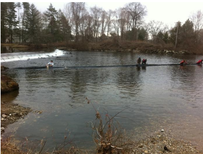
CTDEP and TNC crews work to install the fish guidance boom below the Wood Dam Fishway (out of the photo, to the left). The boom is connected to the fishway to the left and a big boulder to the right to help guide fish to the fishway, particularly during high tide.

Our crew and Sally, Cynthia, and Mark from TNC had a good day on Monday setting up stuff on the Saugatuck River. The Wood Dam guidance boom was installed (see below) and at Lees Pond Dam the fishway was cleaned and opened and a new trash boom installed along with prep work for the temporary fish counter to be installed near the end of the month. There is still work to do at Dorr's Mill Fishway, the Coleytown Fish Diversion boom, and perhaps some clean-up at the Low's and Grossman fishways. For the most part, all first dam fishways across the state are up and running. (Branford folks—what about you? We haven't heard anything.) The Greeneville Dam Fishlift operated for the first time yesterday and the Norwich Public Utilities crew saw a black crappie (going down?). The other Shetucket/Quinebaug fishways will open as soon as anadromous fish show up at Greeneville. Tim expects to open the Kinneytown Fishway tomorrow. Sally Harold reported glass eels from Wood Dam on Monday and our crew saw the first glass eels at Fishing Brook yesterday, so that run is ramping up.