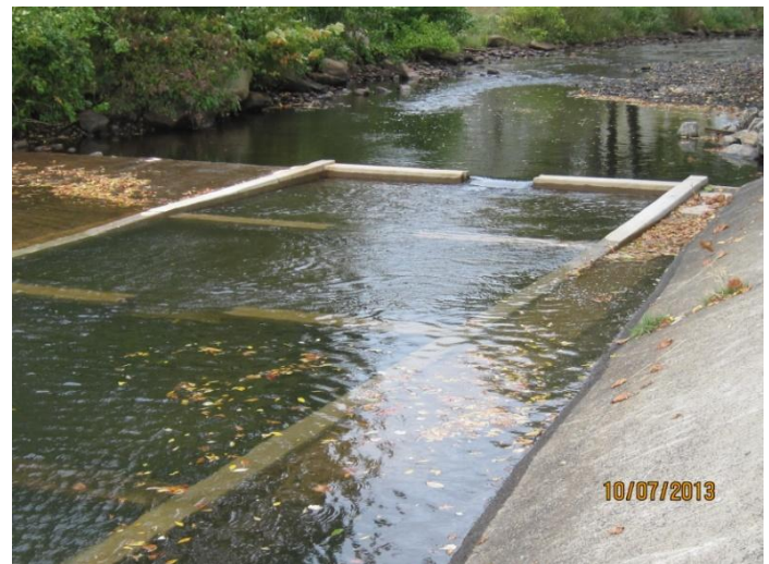
Pequonnock River Apron Fishway: The five-pool pool-and-weir fishway is mostly underwater during high tide but there are drops at each weir during low tide. More photos of this fishway later.