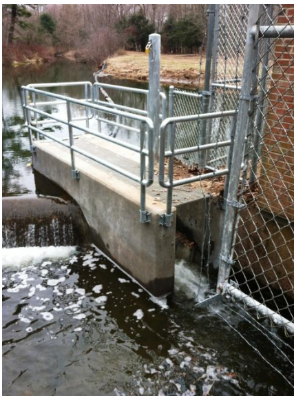
East Haven Diversion Dam Fishway: Even a small dam like this can block runs of river herring. Instead the concrete 'box' is one section of steep pass fishway. To the right is a brick gatehouse.

And finally—UConn men's basketball team are the national champions! Tonight the UConn women seek to duplicate that feat! ☺