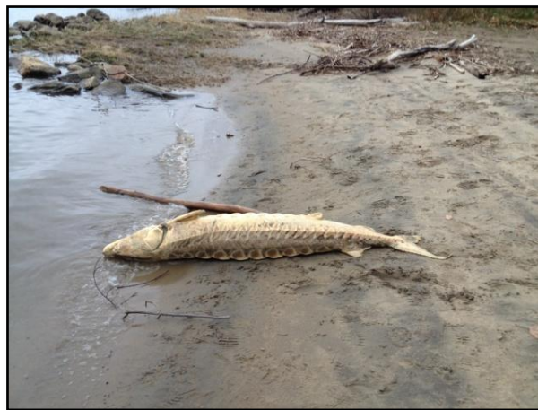
The carcass was relatively untouched. I guess the gulls did not have a cutting torch to get past the bony scutes that cover sturgeon. This fish was found about eight miles up the river but we have no idea how far up it went, where it died or how it died.