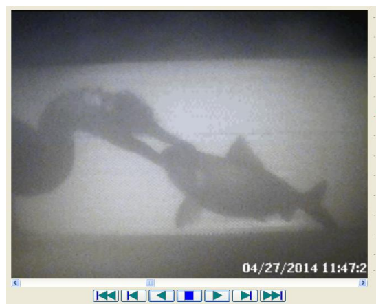
One alewife coming up the Bunnells Pond Fishway on the Pequonnock River in Bridgeport that didn't quite make it. A cormorant entered the fishway exit at the headpond and grabbed this alewife just as it passed the window and got its picture taken.