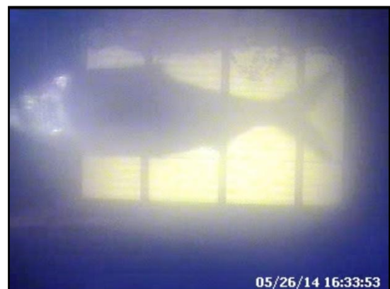
One of the three American Shad counted thus far passing through the Moulson Pond Fishway.