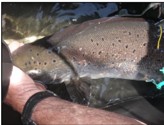
Bruce Williams and crew tag R-002-14 – the second Atlantic Salmon of the season for Rainbow. Note the yellow tag in the upper right-hand corner.

The Atlantic salmon count is now up to 15. Bruce Williams of our program trapped, tagged and released the second of the season for Rainbow Fishway today (see photo below). It was a bright female about 31 inches long and in fair shape; it had some scale loss – not sure why. No hooking wounds detected. We had seen this fish show-up on our video detection system a few days ago, so maybe the scale loss happened as it was running up and down the fishway.