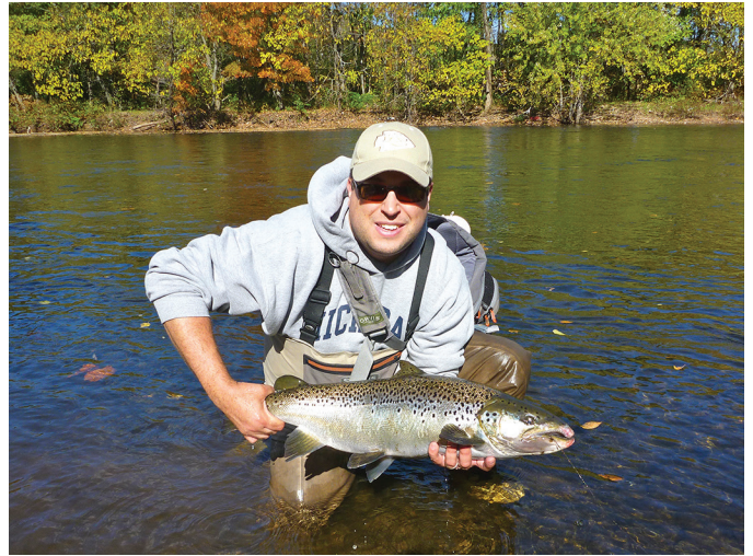
Connecticut Legacy male salmon.