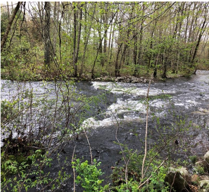
This fish diversion berm for the Moulson Pond Fishway is little more than a speed bump for fish in high water.