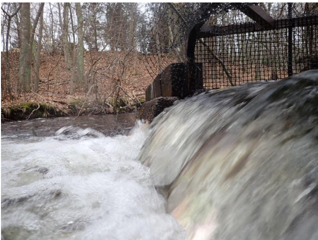
As the run at Brides Brook winds down, we'll share some favorite photos of Alewives entering the fish counter. Look closely at this photo on the left to see the fish shooting up the plunging water.

My weekly Diadromous Fish Radio show is live on iCRV ( www.iCRVradio.com ) at 8:00 am on Wednesdays. If you can't tune in at 8:00 am, listen to it at any time: www.icrvradio.com/programs/program/50 .