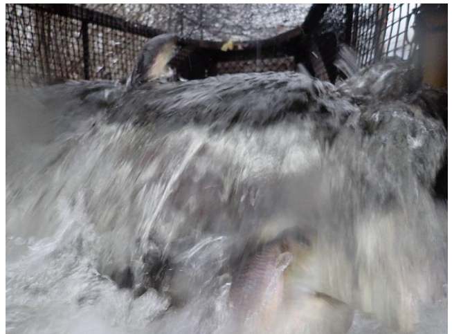
This Alewife was so eager to get upstream it leaped out of the water like a salmon! Another one can be seen in the rushing water below.