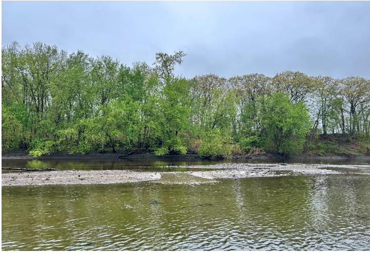
Recently exposed shoal on the Westfield River.