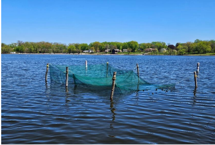
Wethersfield Cove pound net