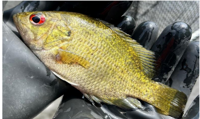
A couple fish we don't often see: above, a bowfin; right, a rock bass