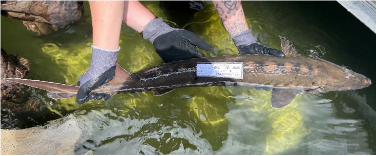
HGE's first short-nosed sturgeon of the year